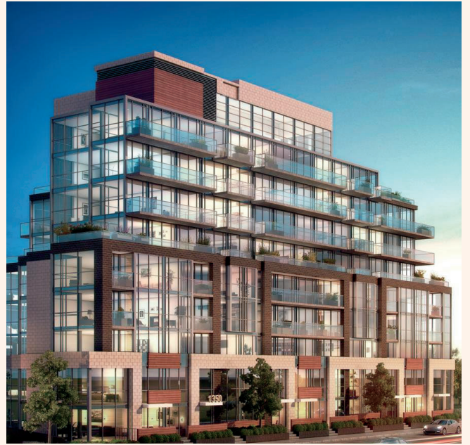
RESIDENCES AT THE HUNT CLUB