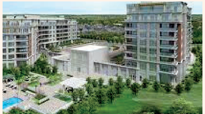
Freehold/Common Elements Projects (POTLs)