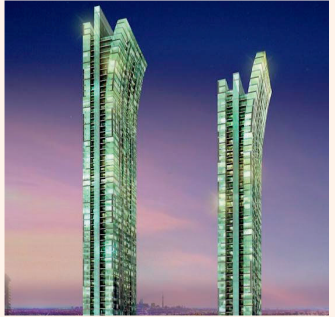
EMERALD PARK CONDOS